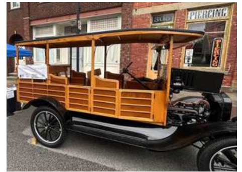
Crawford County Historical Society The Crawford Store 869-871 Diamond Park, Meadville, PA