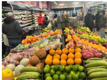
Meadville Grocery Outlet Park Ave Plaza, Meadville, PA