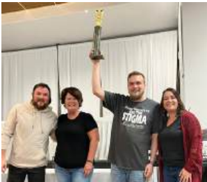
Best Chili: Hitchy's