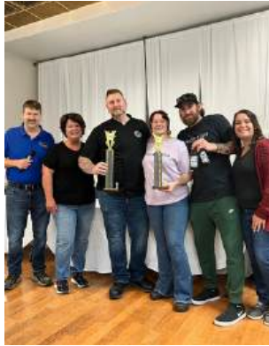
Best Table Display: Riverside Brewing Co