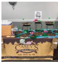
Casey's Ice Cream & Candies