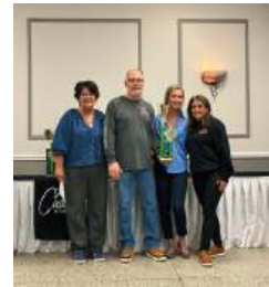
Best Candy: Casey's - Frogs