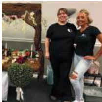
The winner of the Best Table Display: The Lounge at the Oaks