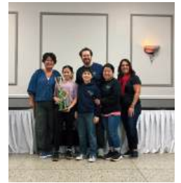
Most Creative Candy: Warner's - S'Mores Truffle