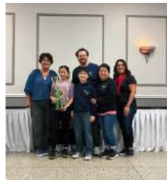
Most Creative Baked Good: Warner's - Chocolate Cupcake w/Salted Caramel