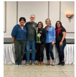
Most Creative Specialty Item: Casey's - Bye Bye Dubai Ice Cream