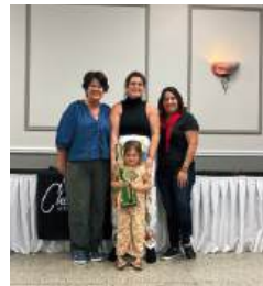
Best Specialty Item: Finney's Chocolate Shoppe - Peanut Butter Egg