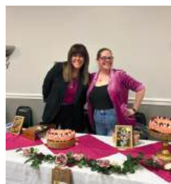
Parkhurst Dining Services & Catering