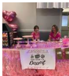
Save Room for Dessert