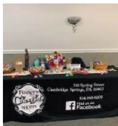
Finney's Chocolate Shoppe