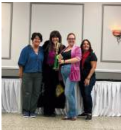
Best Baked Good: Parkhurst - Chocolate Covered Cherry Cheesecake