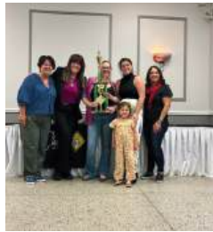
People's Choice: Finney's PB Egg and Parkhurst Amaretto Shooter