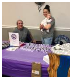
Grammy Stephie's Bakery