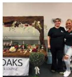
The Lounge at the Oaks