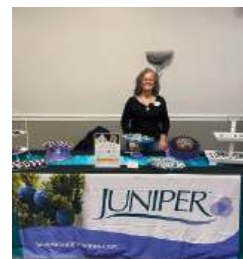
Juniper Village at Meadville